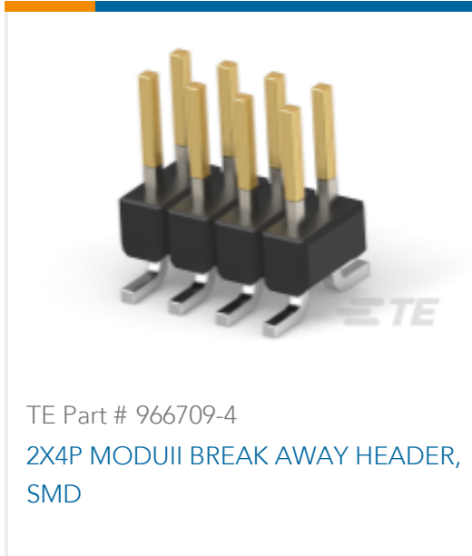
TE Part # 966709-4 2X4P MODU II BREAK AWAY HEADER, SMD