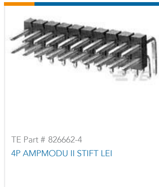
TE Part # 826662-4 4P AMPMODU II STIFT LEI