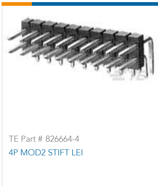
TE Part # 826664-4 4P MOD2 STIFT LEI