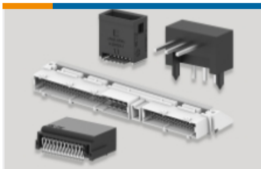
PCB Headers & Receptacles(349)