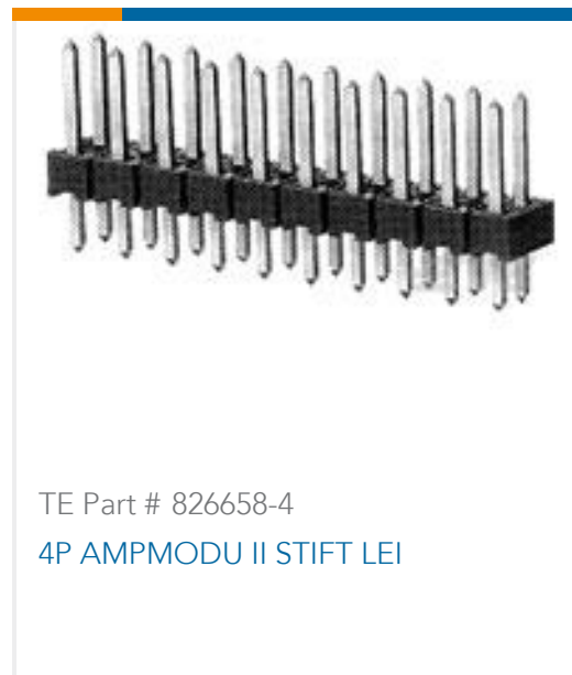
TE Part # 826658-4 4P AMPMODU II STIFT LEI