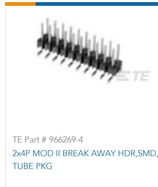
TE Part # 966269-4 2x4P MOD II BREAK AWAY HDR,SMD, TUBE PKG